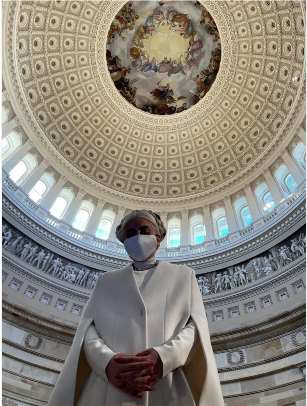
And look at Gaga inside the Apotheosis (raising to the ranks of a God)